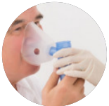
Medical and Biomedical