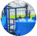
Fluid and Water Management