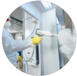
Industrial and Chemical Processing