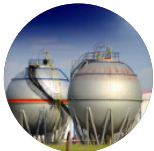
LNG and Cryogenics