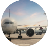
Aerospace and Defense